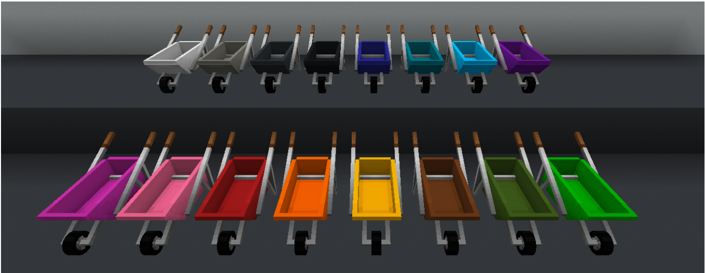
Shown: All 16 color variants of wheelbarrows.