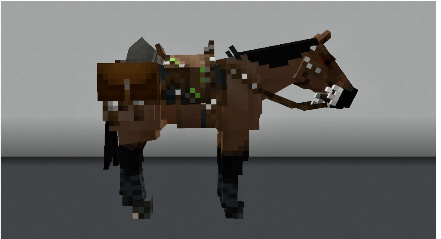
Shown: A Horse wearing adventure tack and a saddlebag.