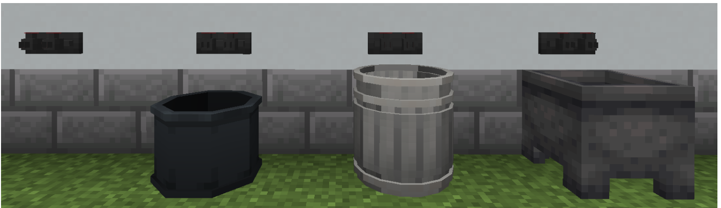
A wall-mounted faucet. Demonstrates proper use with half-barrels, water troughs and cauldrons.