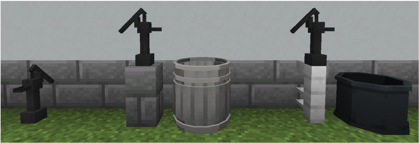
A ground / hand-pump spigot. Demonstrates possible working uses with water troughs and half-barrels.