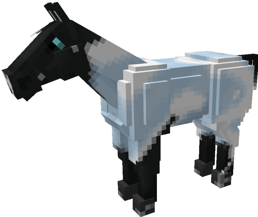
Shown: Halter (16) variants.