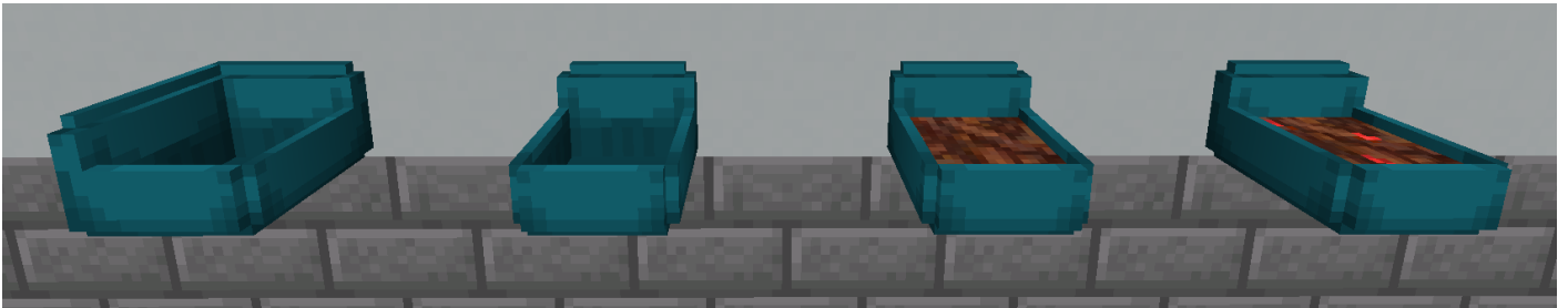
Shown (L-R): Corner grain feeder, grain feeder, grain feeder with sweet feed and grain feeder with rose feed.

Right-click a block with a grain feeder in hand to place it against a vertical (wall) block. When a grain feeder is placed at the intersection of two blocks, it connects to the wall on both corners. The recommended placement of grain feeders is around one block up from the ground, or two for near full-thickness shavings areas of stalls.