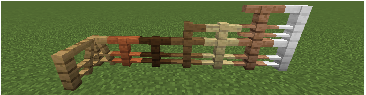
Western fences showing (L-R) single height, including corner variant, 1.5 height and double height combinations.