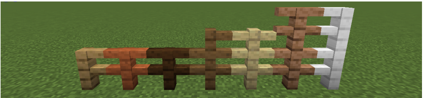
Pasture fences showing (L-R) single height, 1.5 height and double height combinations.