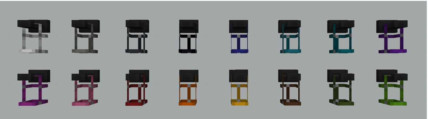
Shown: Bridle rack with all Halter variants.