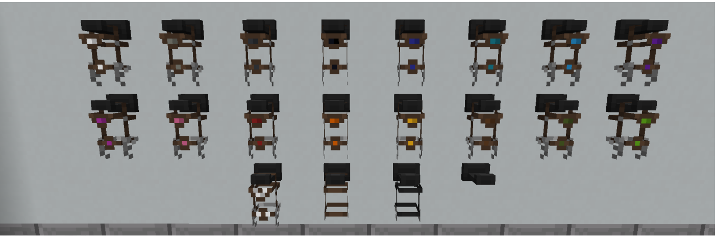
Shown: Bridle rack with all Bridle variants (Western - Adventure - English) and unused version.

A bridle rack can hold one Bridle or Halter at a time. Right-clicking an empty bridle rack with a bridle or halter will place the item, and right-clicking again with an empty hand will remove it.