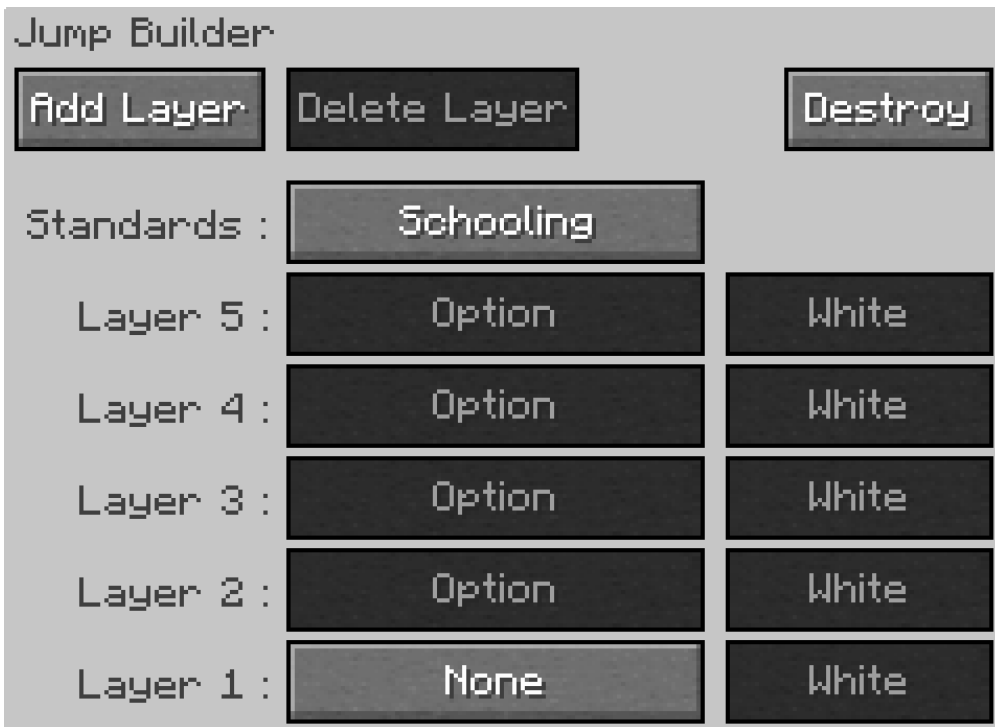
Shown: Jump Builder GUI showing a new jump (blank options) and a 2B vertical jump with rails in blue colors.

Indoor arenas should have a minimum of 11B height clearance if intended to support max-level jumps. This height is the peak point at a max level jump where a rider and horse would comfortably avoid collision with the roof.