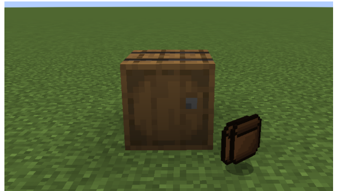
Shear a Barrel (2 x Brown Half Barrels)