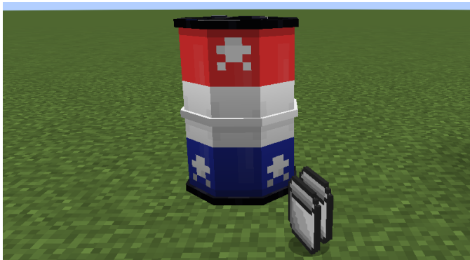
Shear a Western Barrel (2 x White Half Barrels)

A Half Barrel is crafted by right-clicking a Barrel or Western Barrel with Shears.