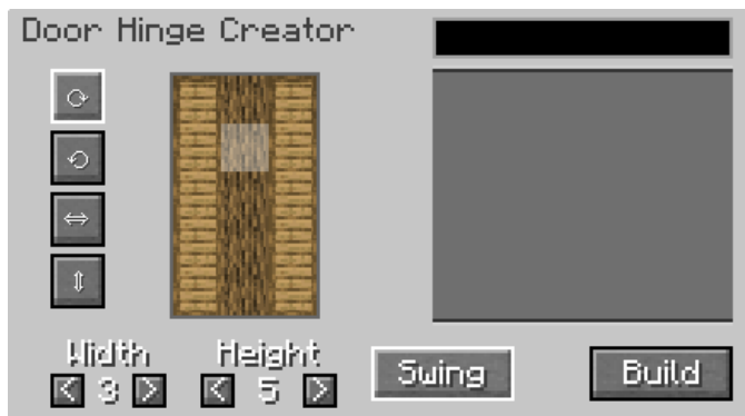
Block Axis Rotation