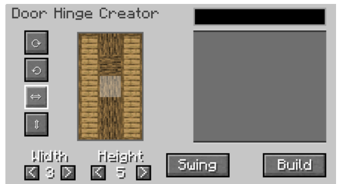
Horizontal or Vertical Block Rotation